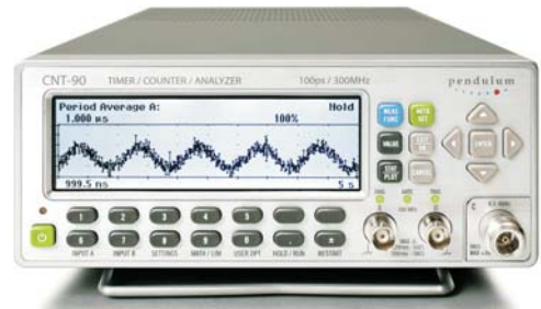
Figure 5: Display showing the trend (signal over time) of sampled data.