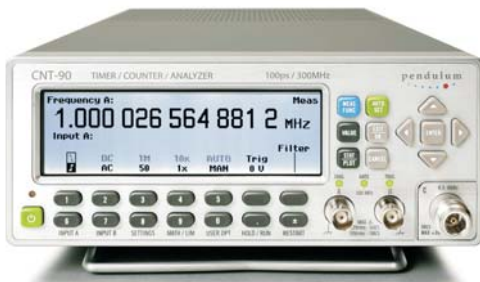
Figure 3: Input parameter setting menu shown with measured result.