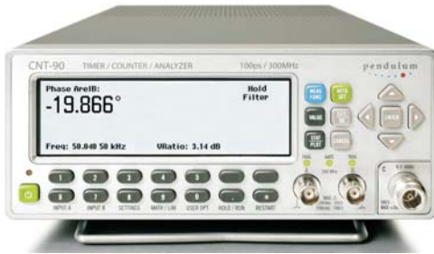
Figure 1: Display showing phase value, frequency, attenuation V_A/V_B , and auxiliary parameters.

When adjusting a frequency source to given limits, the graphic display gives fast and accurate visual calibration guidance.