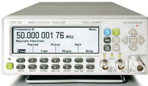
Figure 2: Measure function selection menu, shown with measured results.