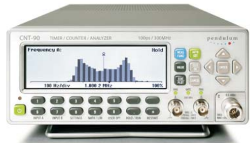
Figure 6: The same result as in figure 5, now displayed as a histogram.