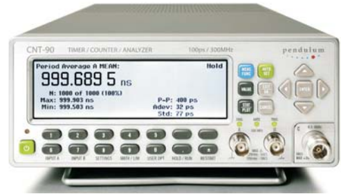
Figure 4: Display showing different statistical parameters viewed at the same time.